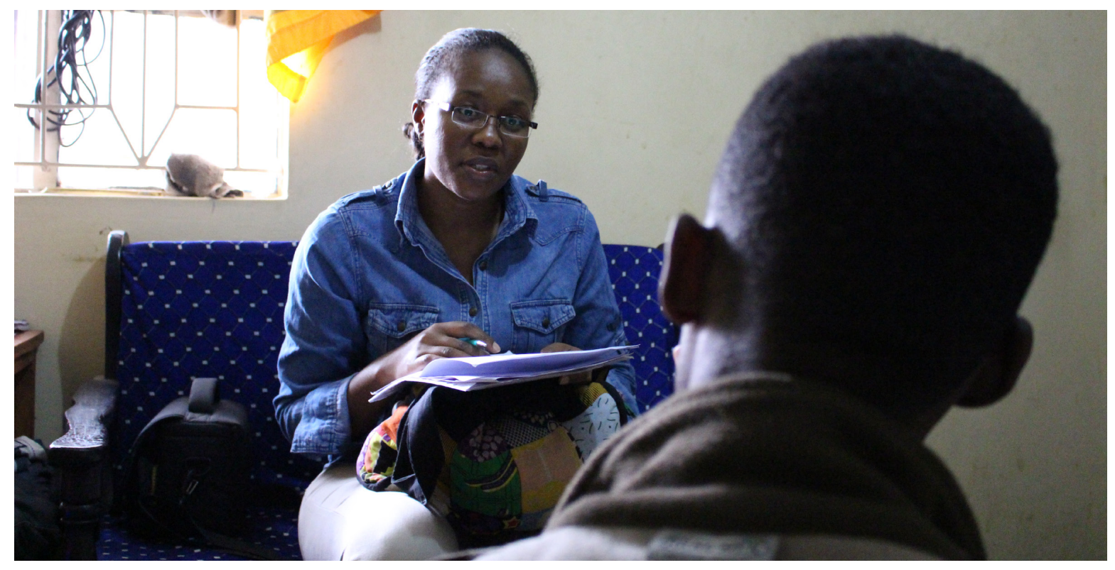
A RefugePoint Social Worker interviews a new client who has hopes of being resettled to the U.S.