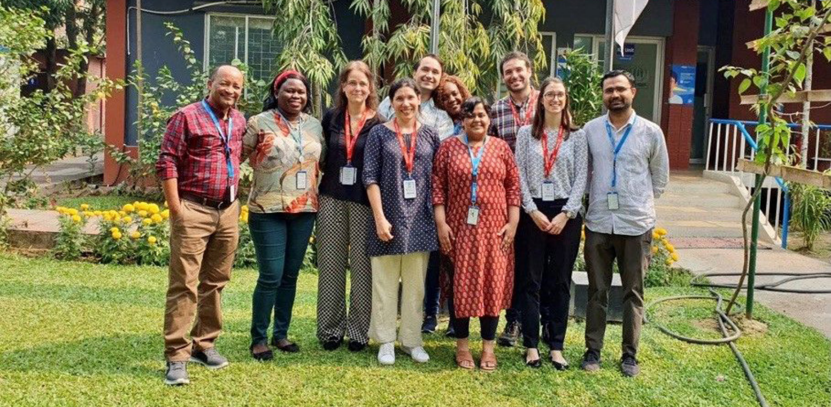
Staff from RefugePoint, Danish Refugee Council, and ICMC in Cox's Bazar, Bangladesh.